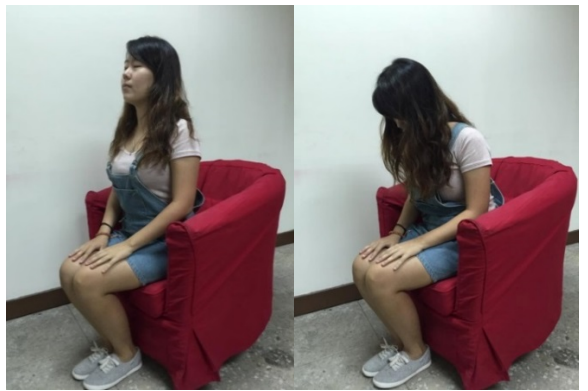
Figure 1. The erect and slouch postures.

Participants were asked to fill out demographic and psychological questionnaires and then sat in a comfortable posture on a sofa. The research procedure consisted of a 2 (erect and slouch postures; Figure 1) \times 2 (recalling happy or depressive events) Latin Square design.